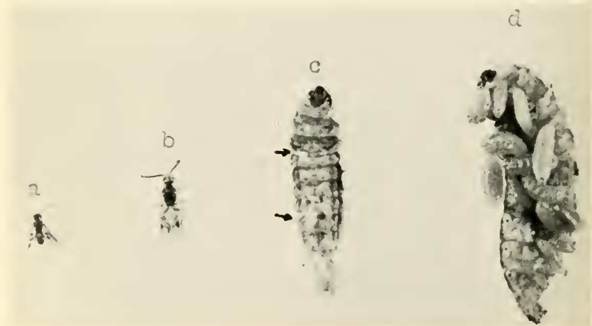
Fig. 1. Different stages of Bracon lefroyi . a - a male parasite; b - a female parasite; c - a host larva with the parasite eggs on it; d - a host larva with the parasite larvae on it.

Adult parasite insects resulting from the eggs mated within 24 hours after emergence. Prior to mating, the male, on approaching the female, became very excited and displayed a wing vibrating behavior. One male could mate with several females and mating lasted only a few seconds. Oviposition started 2 weeks after mating. Before oviposition, the parasite paralysed the host larva by repeated stinging and 15 to 20 minutes later, when the host had become immobile, the parasite started to lay eggs on it. The parasite, without exception, oviposited (Fig. 1) between and around the abdominal legs of the host first. Additional eggs, however, were laid on other parts of the host body, starting with the thoracic legs. When a combination of 1st to 5th instar larvae was offered, the parasite decidedly preferred to oviposit on the largest larvae first. Later, additional eggs were laid on the 3rd and 4th instars also. Although the 1st and 2nd instar host larvae were occasionally paralysed, no